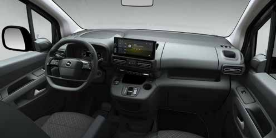
Brasilia China Grey Graphite & Brasilia Rajoles cloth seat trim