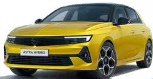
Yellow Amber Solid paint