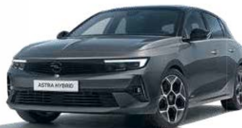
Artense Grey Metallic paint*