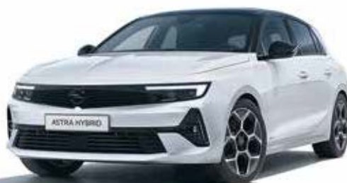
Jade White Metallic paint*