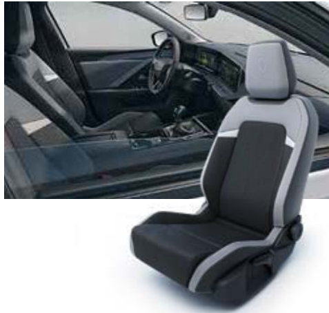
SC: Jet black Comfort seats edition.