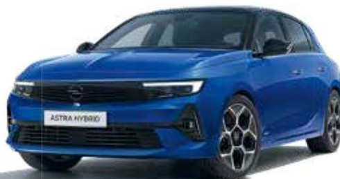
Vertigo Blue Premium paint*