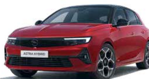
Hot Red Premium paint*

E&OE October 2024. Images shown for illustration purposes only. Please discuss colours available with your local Opel Dealer. *Premium, Metallic and Brilliant paint optional at extra cost. Solid paint at no optional extra cost. Due to the limitations of the printing process, the colours reproduced may vary slightly from the actual paint colour and trim material. As a result, they should be used as a guide only. Your Opel dealer has a comprehensive display of paint finishes.