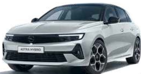
Crystal Silver Metallic paint*