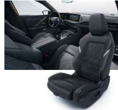
GS: Jet black Alcantara Suede leather effect trim.