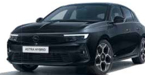
Perla Black Metallic paint*