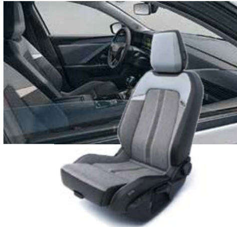
ELEGANCE: Isabella Cloth + Vinyl interior trim