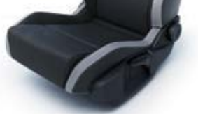
SC: Jet black Comfort seats edition.