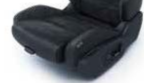
GS: Jet black Alcantara Suede leather effect trim.