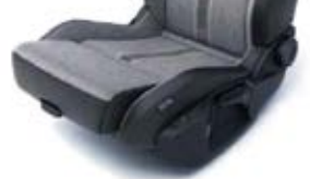
ELEGANCE: Isabella Cloth + Vinyl interior trim